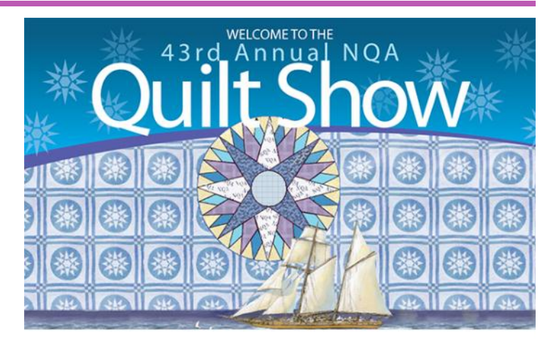
June 14-16, 2012

http://www.thequiltshow.com/os/blog.php/ blog_id/4772