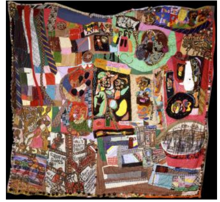
Poindexter Village quilt, a Rag-GonNon in a private collection.

lived there. Much of her work is her interpretation of the stories she heard from the elders in her family and her childhood memories. Her RagGonNons can be found at the Columbus Museum of Art, and the National Underground Railway Freedom Center in Cincinnati.