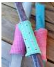
Easy Freezie Koozie

https://www.fynesdesigns.com/easy-sew-freezie-koozie/