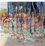
Mermaid Beach Towels

https://www.parents.com/fun/activities/outdoor/fun-summer-ideas/?slide=slide_2022521#slide_2022521