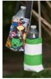
Insulated Water Bottle Carrier

https://www.peakaboopages.com/2015/07/insulated-water-bottle-carrier.html