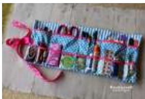
Roll Up Organizer

https://www.doodlecraftblog.com/2014/09/roll-up-glove-box-essentials-caddy.html