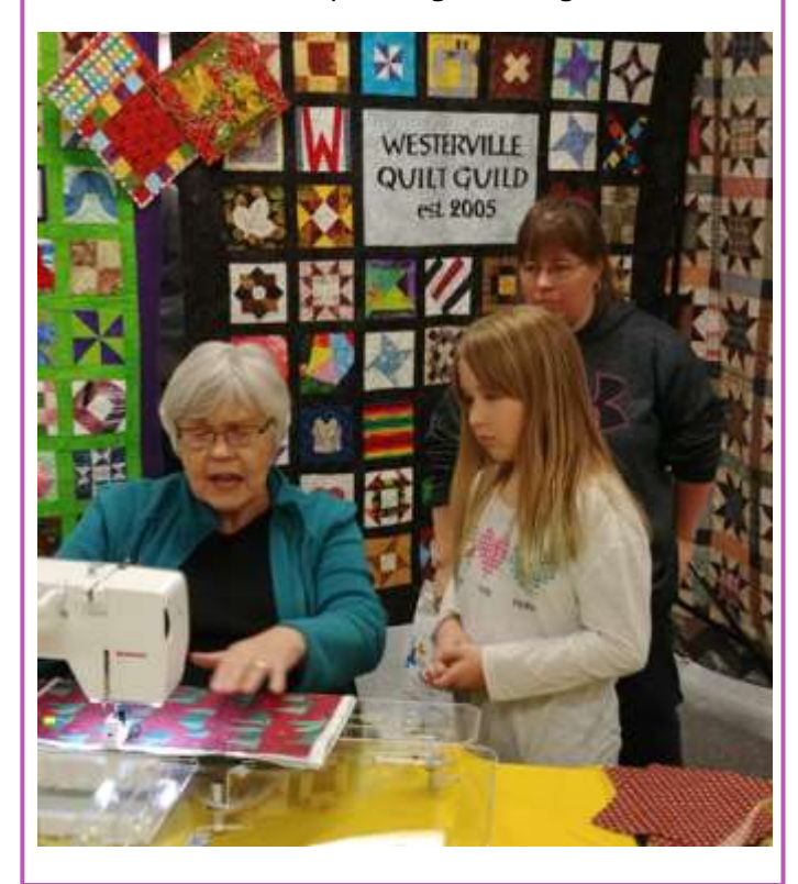
Quilt Spectacular "Around the Block" May 4 & 5, 2018

Children are our future quilters and citizens. Encouraging them to learn a new skill makes a positive impact in so many ways. We may have even made an impression on their parents who have an interest in quilting. Keep your eyes open for visitors at our upcoming meetings.