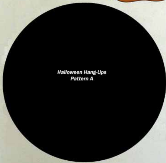
Halloween Hang-Ups Pattern A