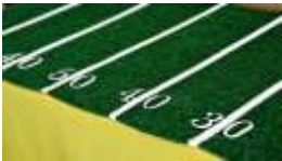
Football Field Table Cloth

http://seevanessacraft.com/2014/09/party-easy-football-field-tablecloth/