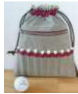
DIY Golf Tee Bag

https://vickymyerscreations.co.uk/tutorial-2/sewing-golfer-diy-golf-gift/