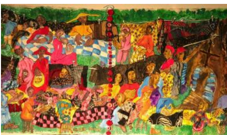
Drawing made with homemade paper and embellished with buttons.