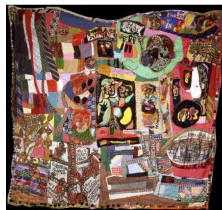
Poindexter Village quilt, a RagGonNon in a private collection.