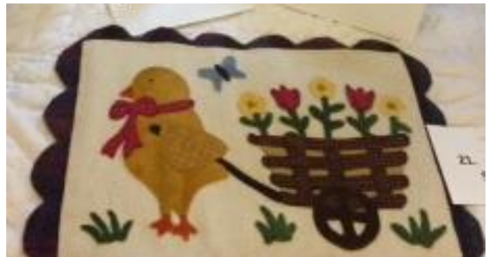
Quilts by Vickie Mills—our March Featured Quilter!